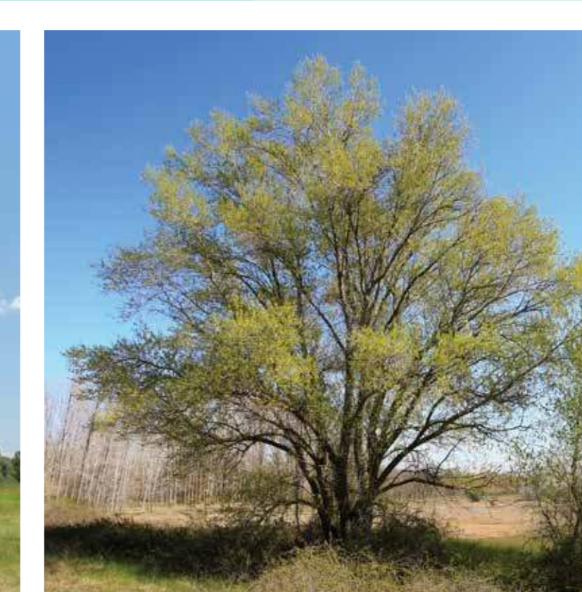
White Willow ( Salix alba )