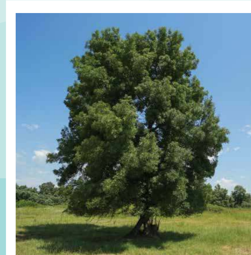
Narrow-leaved Ash ( Fraxinus angustifolia )