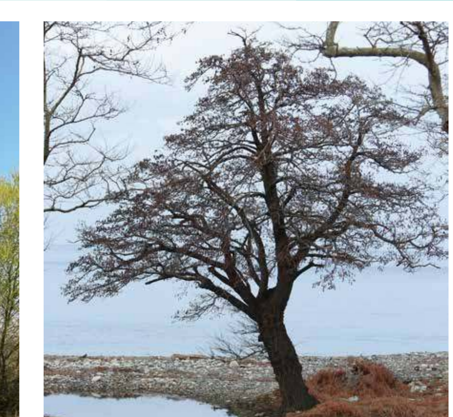
Black (Common) Alder ( Alnus glutinosa )